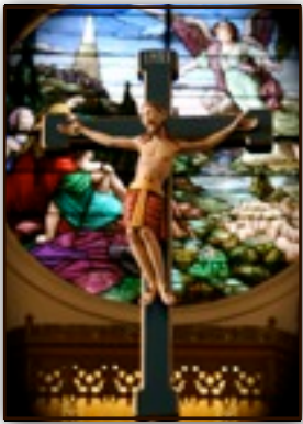
And the Word became flesh and dwelt among us. John 1:14 ESV

The new church year begins by focusing on the humble coming of the Lord. "Advent" is from the Latin word that means "coming."