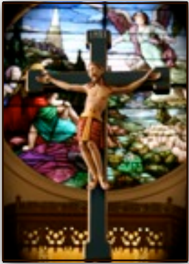
And the Word became flesh and dwelt among us. John 1:14 ESV