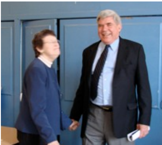
Emmaus alums laugh over locker memories of yesteryear.

So shall our every word and deed Unite us with the heav'nly host To serve and praise unendingly The Father, Son, and Holy Ghost.