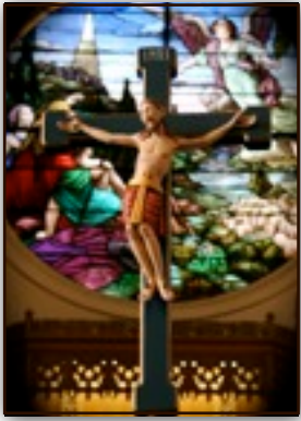
And the Word became flesh and dwelt among us. John 1:14 ESV